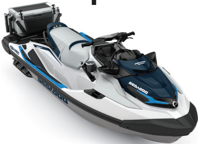
White & Gulfstream Blue

Find yourself a new perspective on sportfishing with the stable, versatile vehicle that started it all.