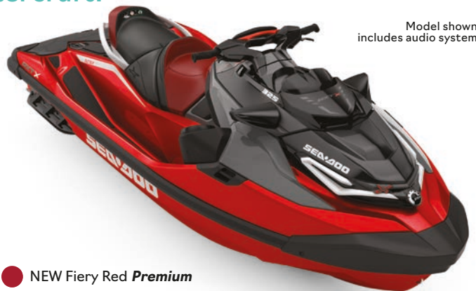
Model shown includes audio system