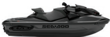
● Premium Triple Black