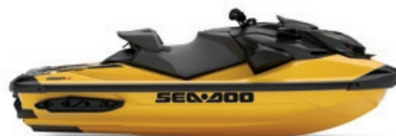
● Millennium Yellow